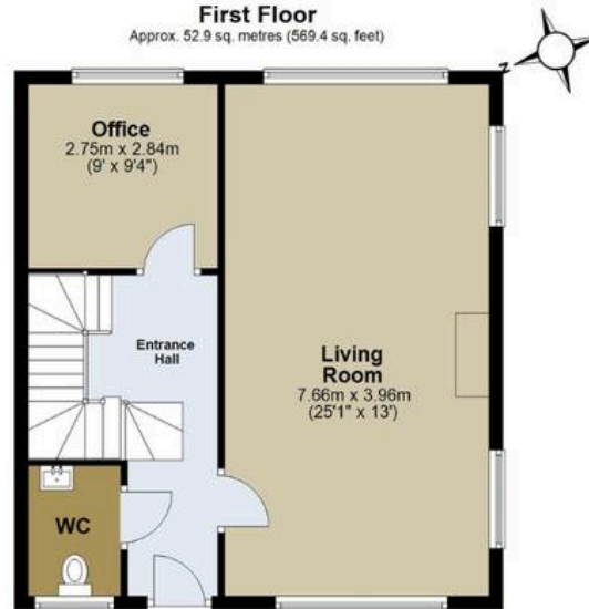
First Floor Approx. 52.9 sq. metres (569.4 sq. feet)