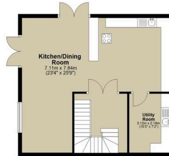
Ground Floor Approx. 55.8 sq. metres (600.3 sq. feet)