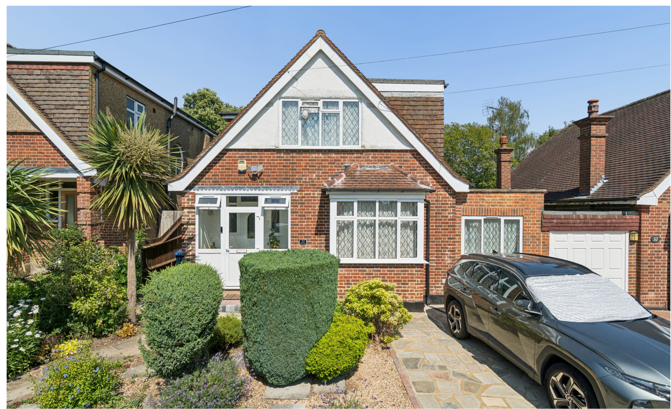
A three bedroom detached bungalow in a convenient location for local amenities Harlyn Drive, Pinner, HA5 2DF