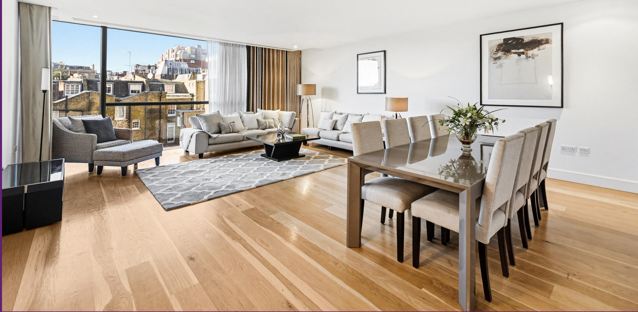
The Knightsbridge Apartments 199 Knightsbridge, SW7