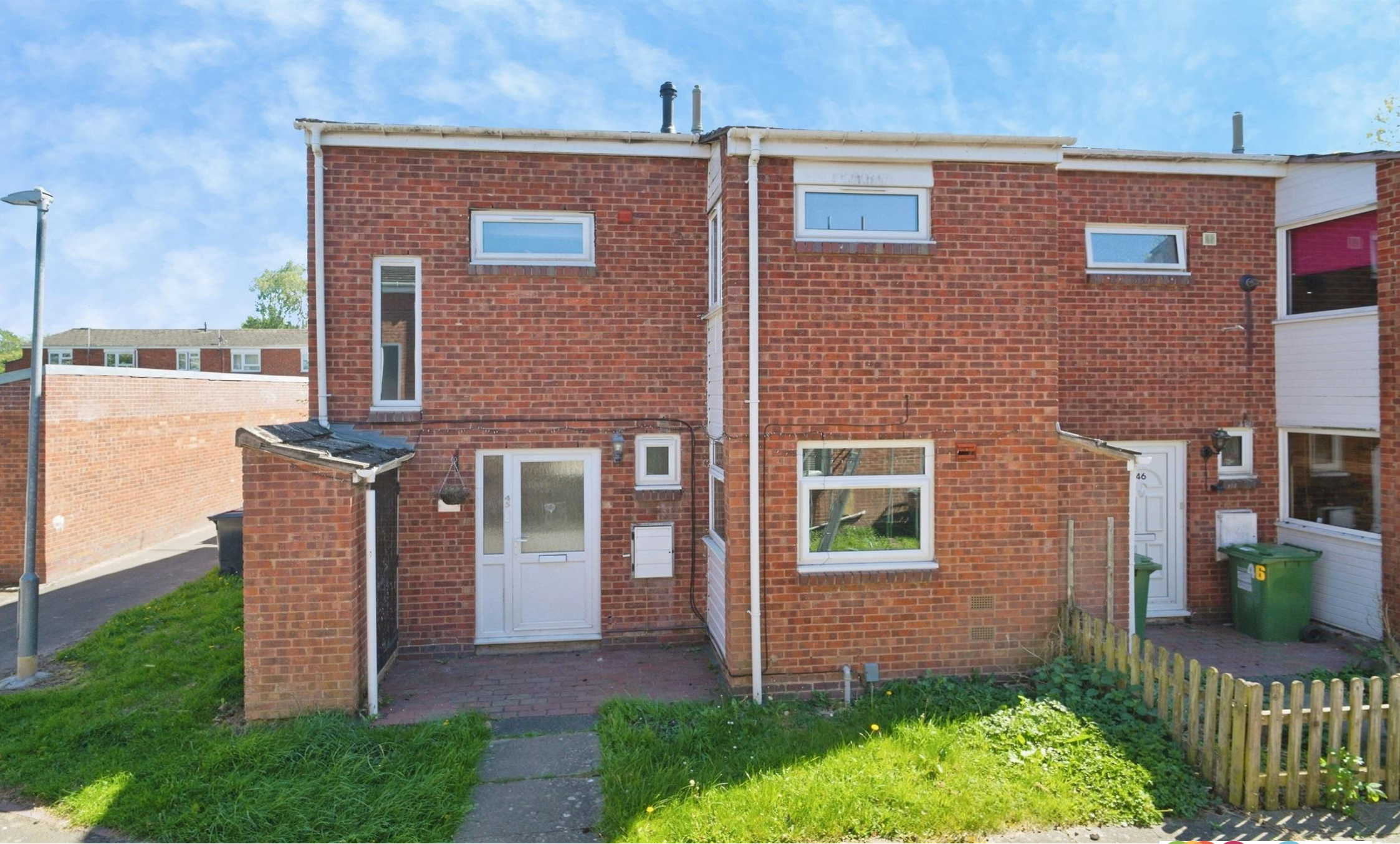
Linton Close, Redditch B98 0NB