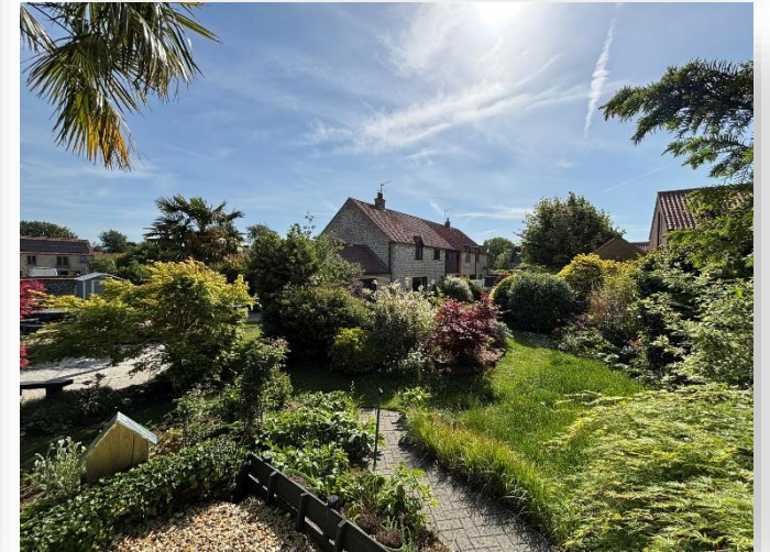
Hovells Lane, Northwold, Thetford, IP26 5NA