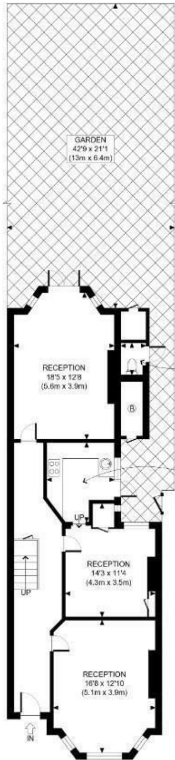
GROUND FLOOR GROSS INTERNAL FLOOR AREA 841 SQ FT