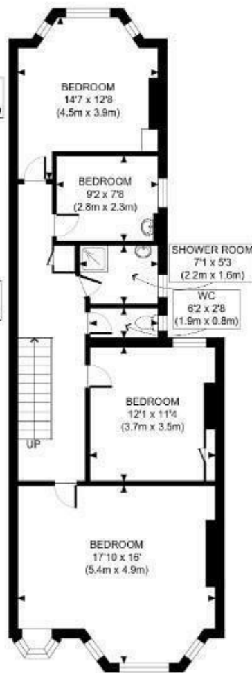
FIRST FLOOR GROSS INTERNAL FLOOR AREA 846 SQ FT

APPROX. GROSS INTERNAL FLOOR AREA WITH EAVES STORAGE: 2144 SQ FT/ 199 SQM APPROX. GROSS INTERNAL FLOOR AREA WITHOUT EAVES STORAGE: 2052 SQ FT/ 191 SQM