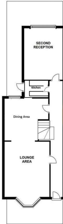
GROUND FLOOR APPROX. 61.5 SQ. METRES (661.9 SQ. FEET)