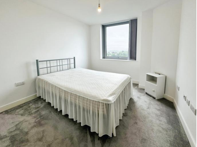
BEDROOM 10' 9" x 9' 10" (3.3m x 3.0m) Front aspect window, carpet, radiator and wardrobe.

BATHROOM 6' 6" x 6' 2" (2.0m x 1.9m) Bath with shower over, low-level WC, wash hand basin, towel radiator and tiled floor.