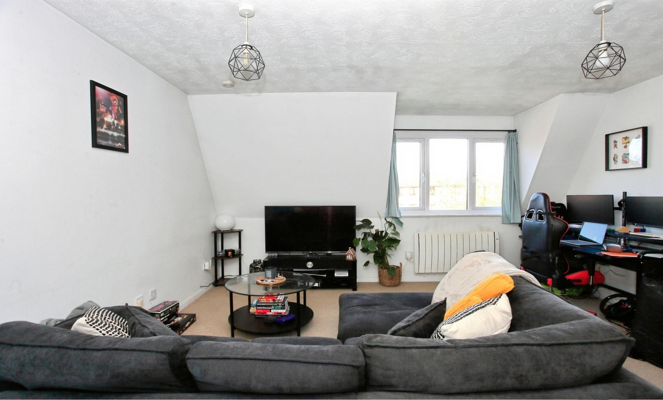
Hadrians Court, Peterborough PE2 8NH