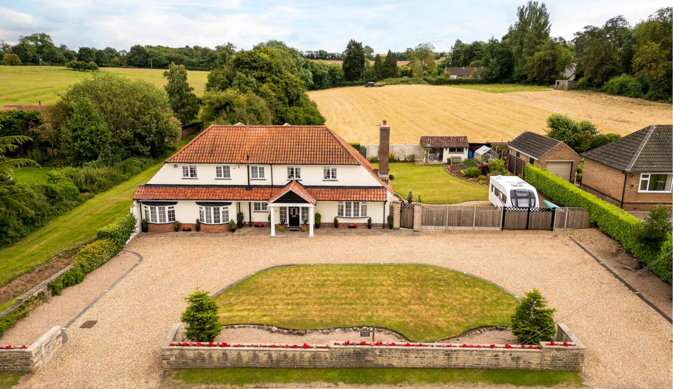
BLUE RIDGE COTTAGE, WELHAM OIRO £625,000