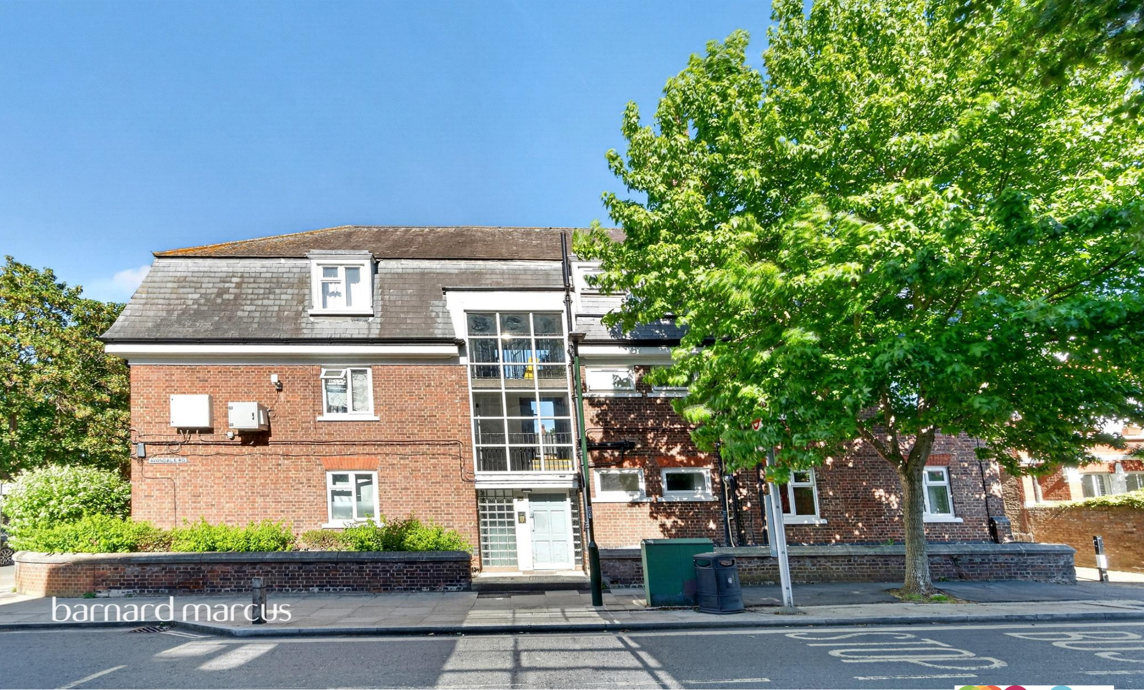
Ashleigh House Mortlake High Street, Mortlake London SW14