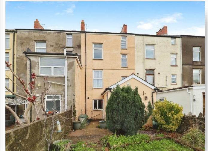
Windsor Road, Penarth, CF64 1JN