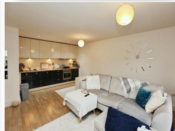
The Salthouse Apartments Salt Meat Lane,GOSPORT PO12 1GH