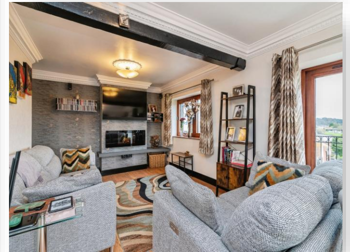
Turneys Court, Nottingham NG2 3BW