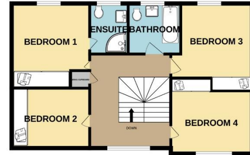
1ST FLOOR 677 sq.ft. (62.9 sq.m.) approx.