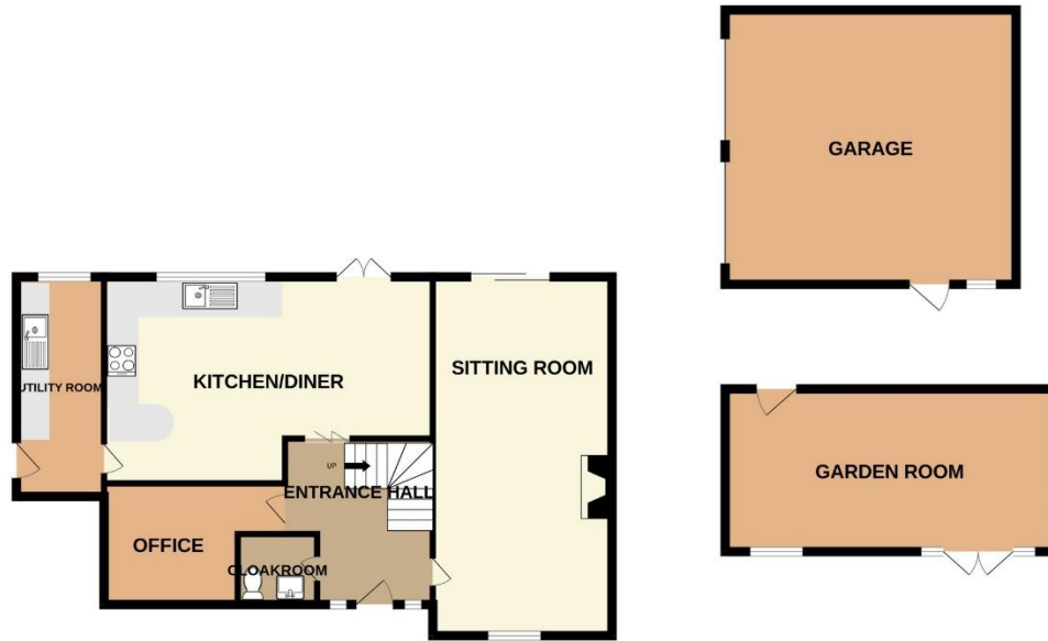
GROUND FLOOR 1276 sq.ft. (118.6 sq.m.) approx.