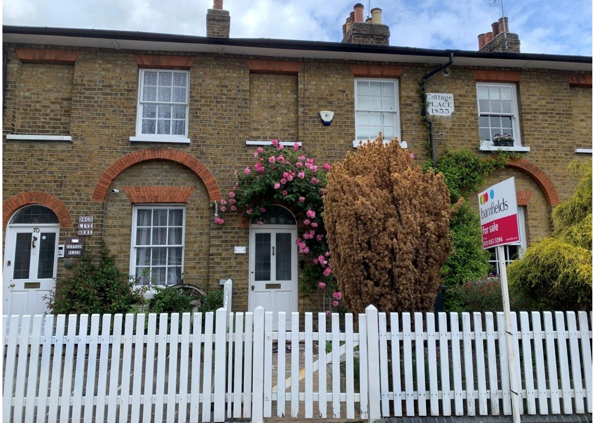
Forty Hill, Enfield, EN2 9EG