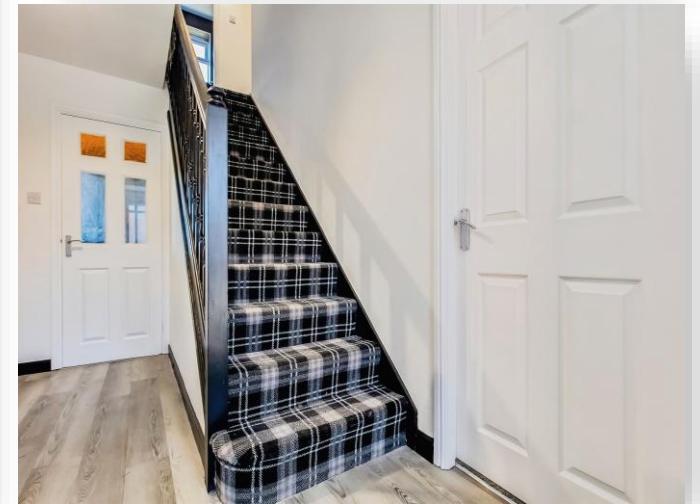
Garston Road, Corby NN18 8NG