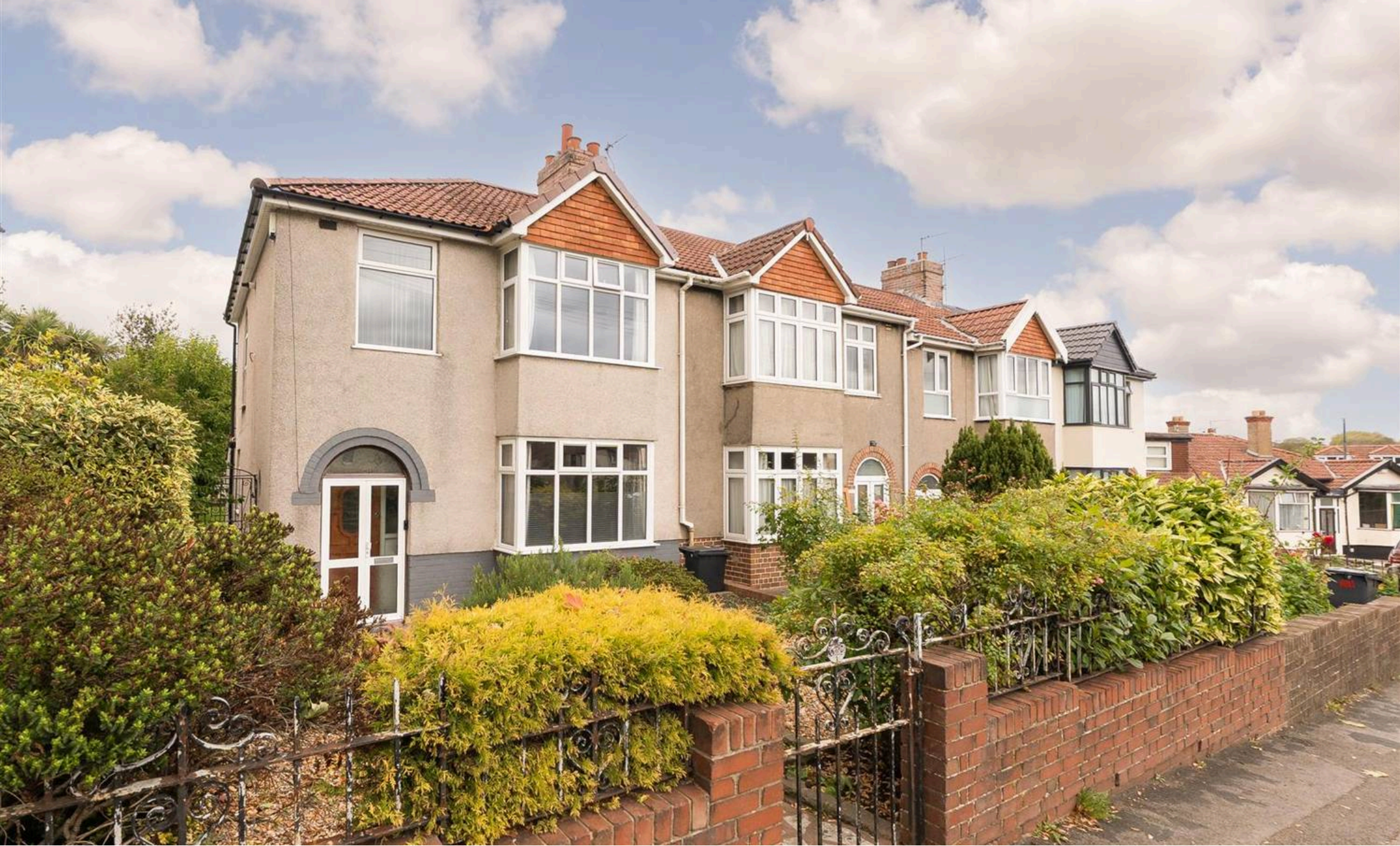
629 Muller Road, Eastville £460,000