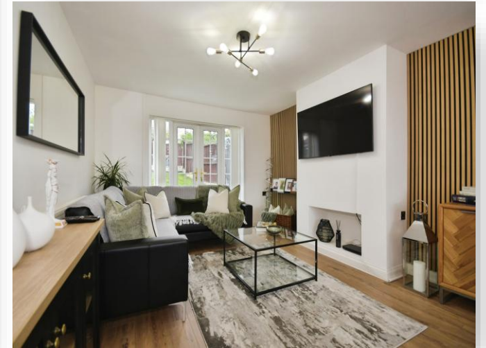
Oak Road, Mexborough S64 9EQ