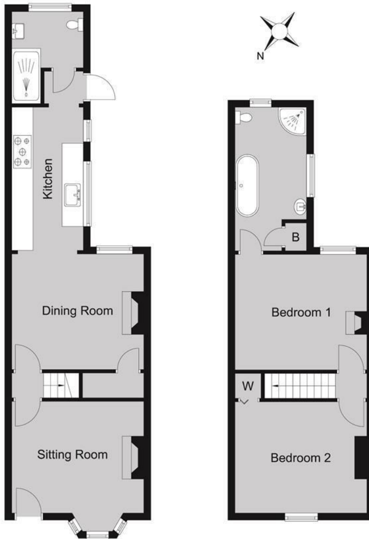
Main area: Approx. 76.6 sq. metres (825.0 sq. feet)

Council Tax Band B. The amount payable under tax band B for the year 2025/2026 is £1,865.10.