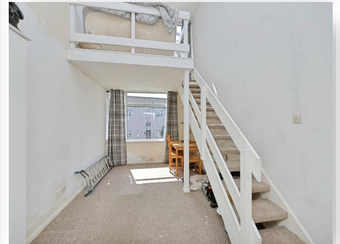
Mandells Court, Norwich, NR3 1AY