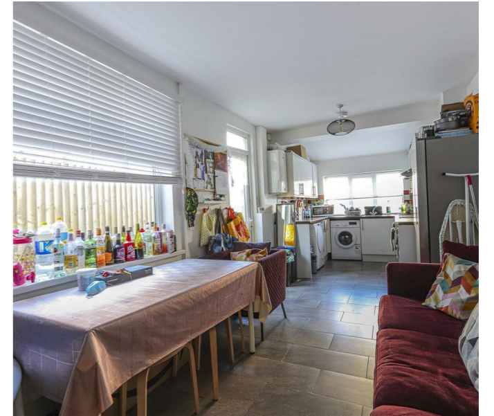
Dogfield Street, Cathays