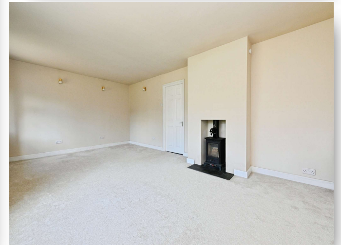
Hurst Crescent, Welney, Wisbech, PE14 9QJ