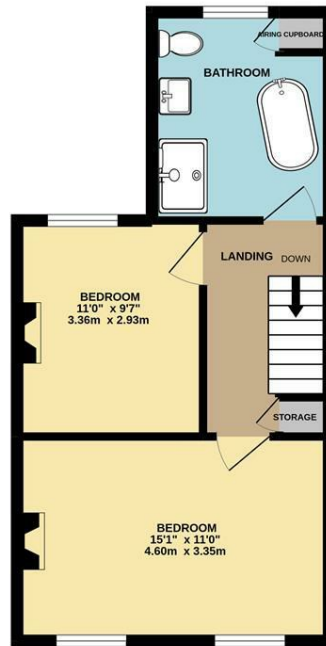
1ST FLOOR 427 sq.ft. (39.7 sq.m.) approx.