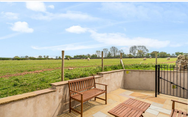
Rear Terraced Patio

The fitted kitchen features, integrated electric hob, oven and extractor, with integrated dishwasher, fridge and freezer. Stainless steel sink with hot and cold taps. Wooden effect worktops with ample wall and base units. Storage cupboard. Double glazed window and access to rear aspect. Laminate flooring. Adjacent to the kitchen, is the dining room. The dining room, with its exposed wooden beams is the perfect space for entertaining guests and family gatherings. Double glazed window to rear aspect. Laminate flooring.