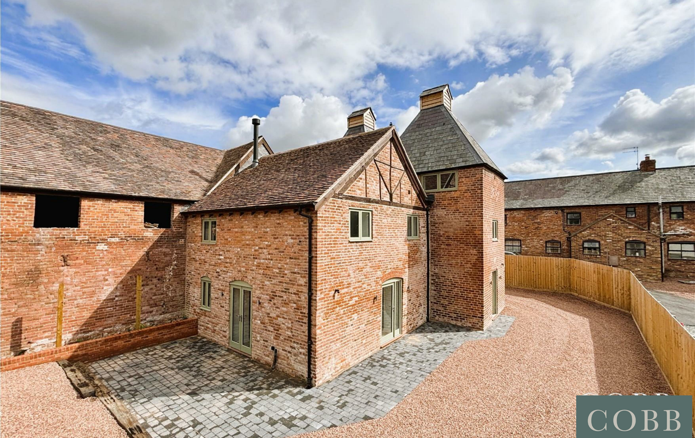
The Old Oast House, Burford, Tenbury Wells, WR15 8HH Offers Over £550,000