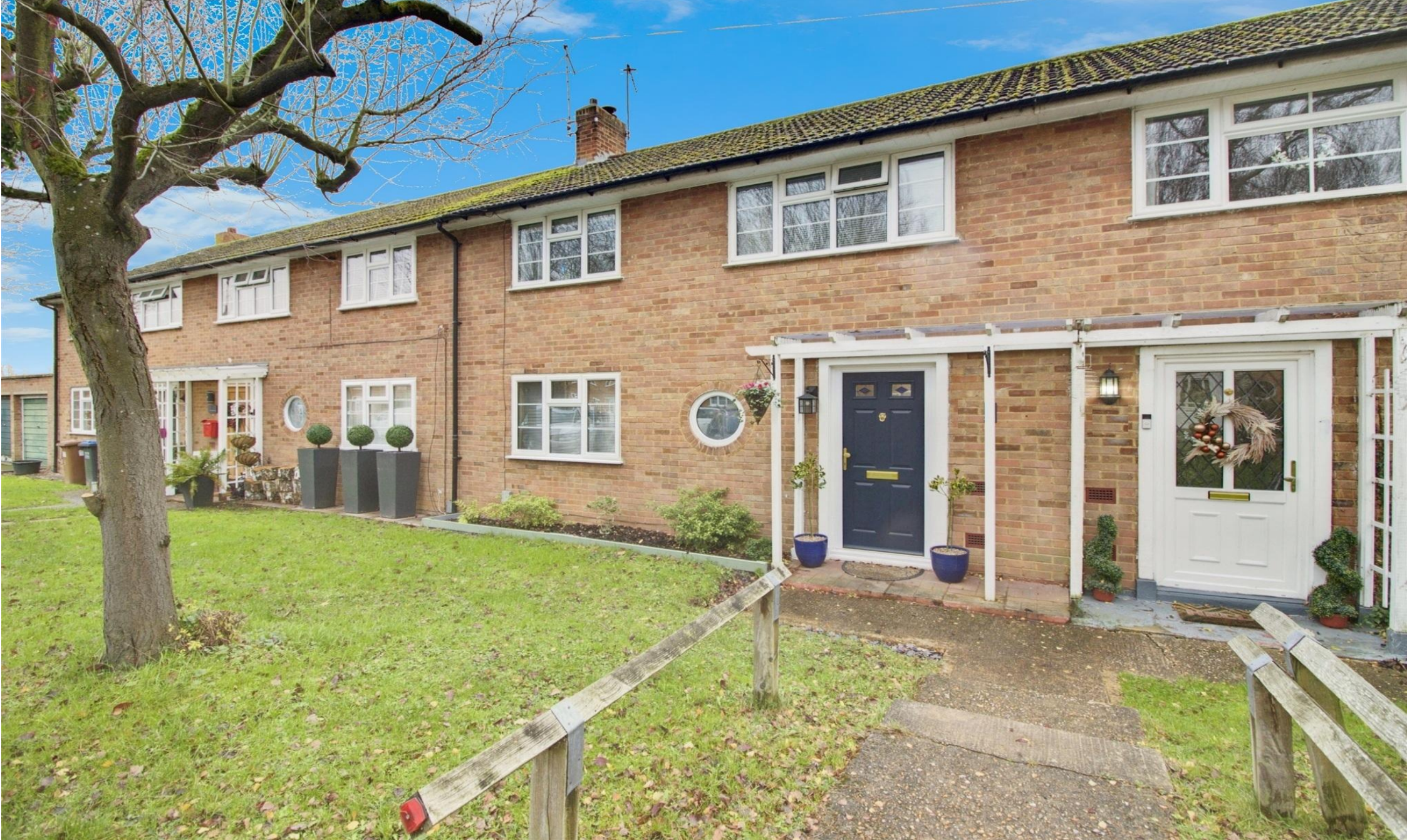
Autumn Grove, WELWYN GARDEN CITY AL7 4DB