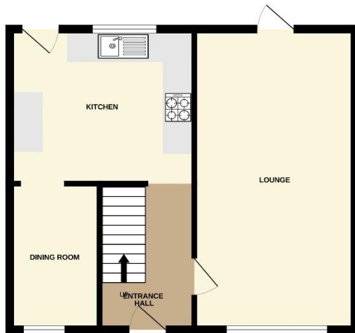
GROUND FLOOR 488 sq.ft. (45.3 sq.m.) approx.