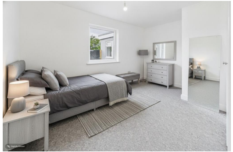
Virtually Staged Bedroom 2

machine beneath, the room also benefits from a window to the front elevation and a glazed uPVC door providing access to the rear.