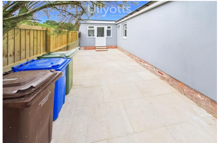
Rear Of The Property