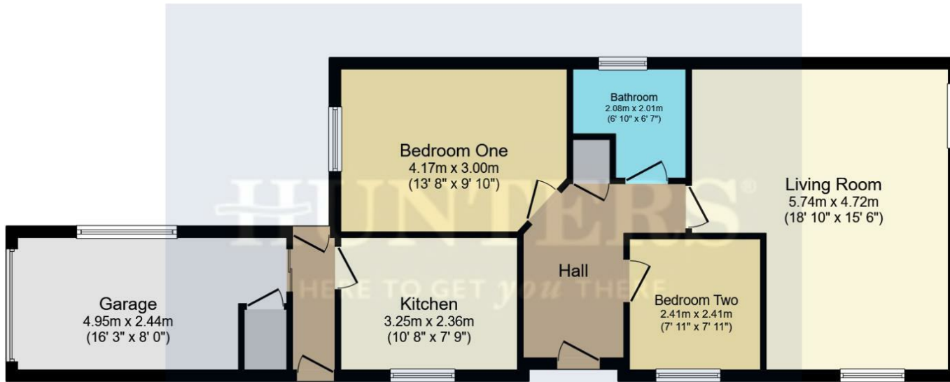
Floor Plan Floor area 75.9 sq.m. (817 sq.ft.)

Total floor area: 75.9 sq.m. (817 sq.ft.)