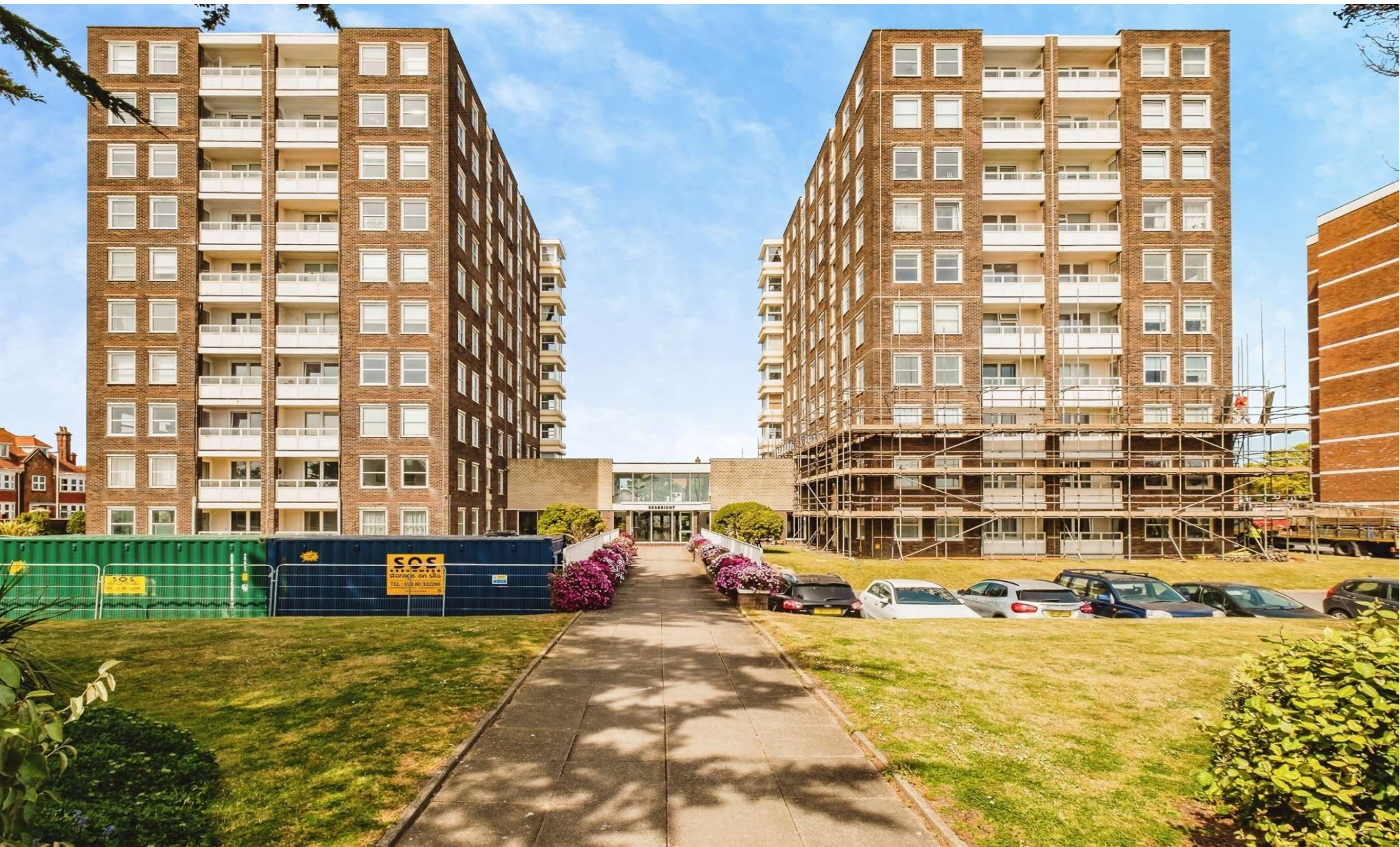
Seabright West Parade, Worthing BN11 3QT