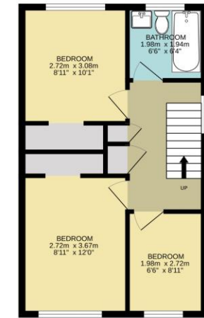
1st floor 38.3 sq.m. (412 sq.ft.) approx.

TOTAL FLOOR AREA: 90.3 sq.m. (972 sq.ft.) approx. Measurements are approximate. Not to scale. Illustrative purposes only. Made with Metropix (2020)