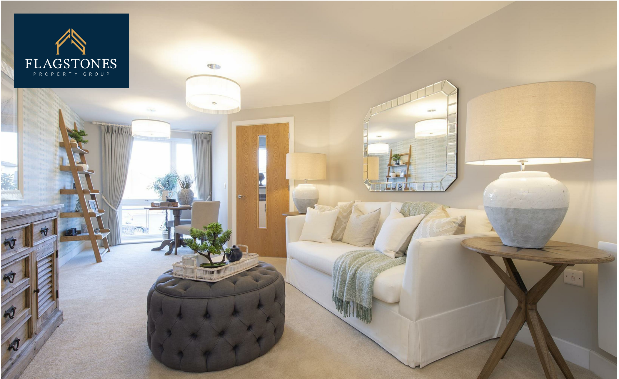
Apartment 26, Priory Place Alcester Road, Studley, B80 7AR £205,000