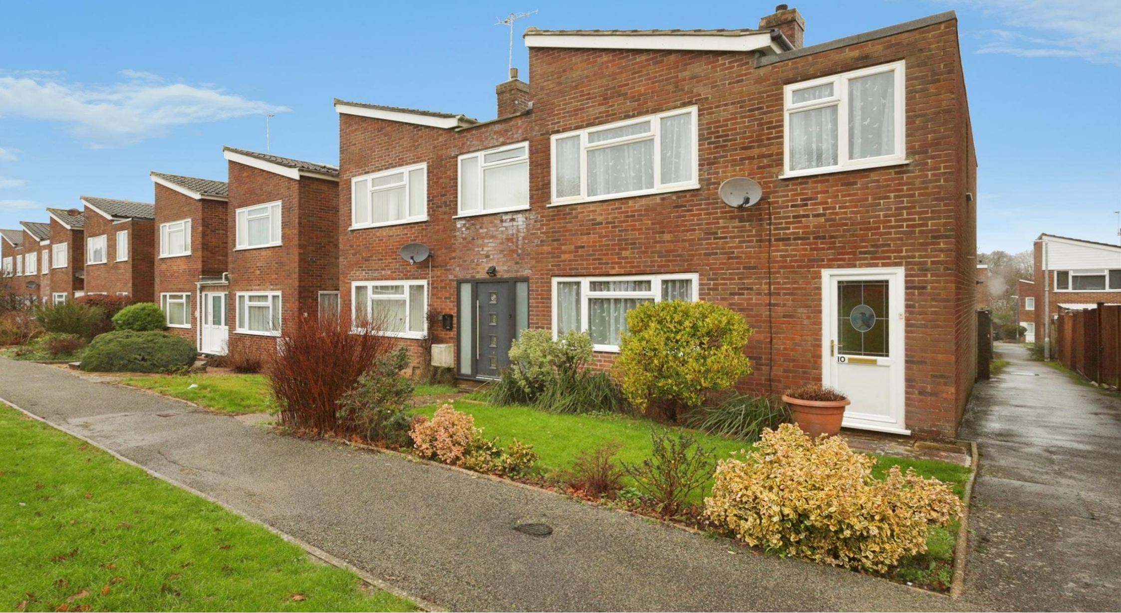
Hayland Green, Hailsham BN27 1SR