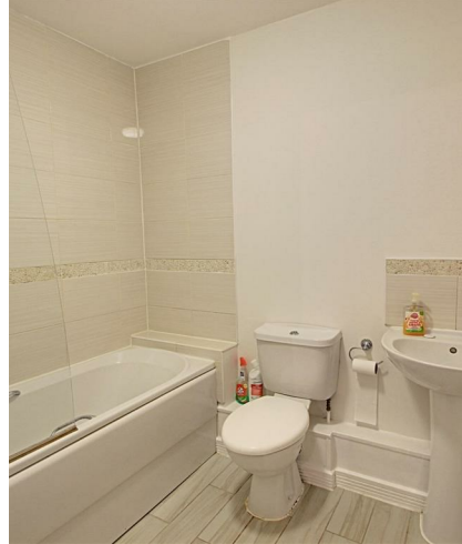
A well presented two bedroom apartment in a popular development.