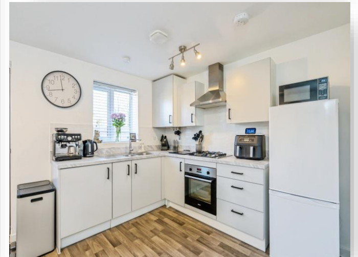
Baggarley Close, Eastergate Chichester PO20 3BP