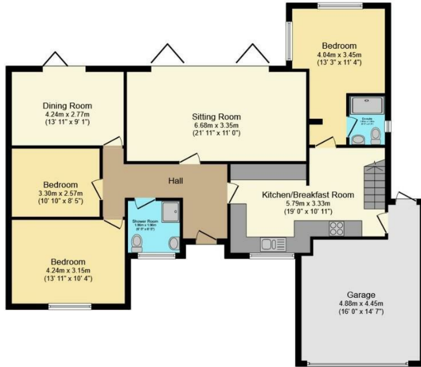
Ground Floor Floor area 130.3 sq.m. (1,403 sq.ft.)