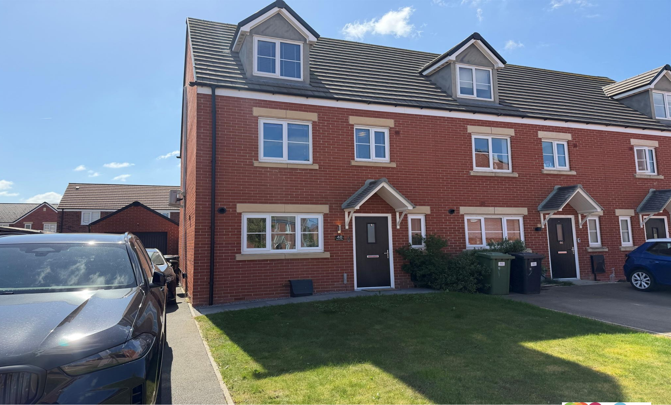
Morton Close, Hampton Gardens Peterborough PE7 8RR