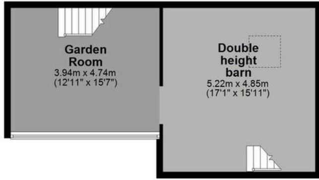
Ground Floor Approx. 119.7 sq. metres (1288.5 sq. feet)