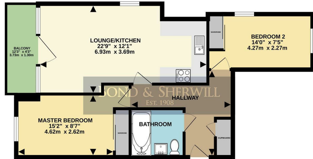
FIRST FLOOR 621 sq.ft. (57.7 sq.m.) approx.

TOTAL FLOOR AREA: 621 sq.ft. (57.7 sq.m.) approx. Whilst every attempt has been made to ensure the accuracy of the floorplan contained here, measurements of doors, windows, rooms and any other items are approximate and no responsibility is taken for any error, omission or mis-statement. This plan is for illustrative purposes only and should be used as such by any prospective purchaser. The services, systems and appliances shown have not been tested and no guarantee as to their operability or efficiency can be given. Made with Metropix ©2025