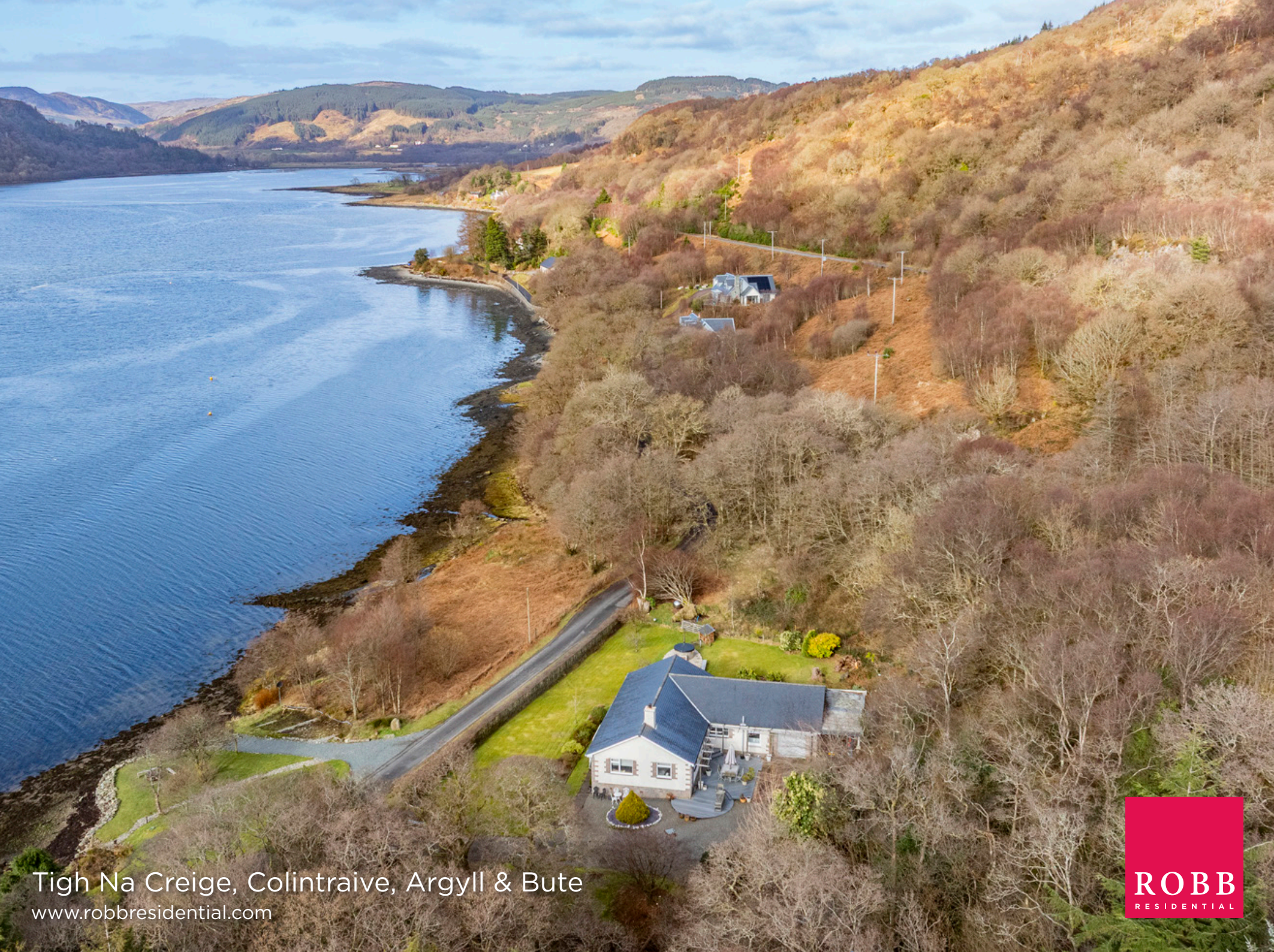
Tigh Na Creige, Colintraive, Argyll & Bute www.robbresidential.com