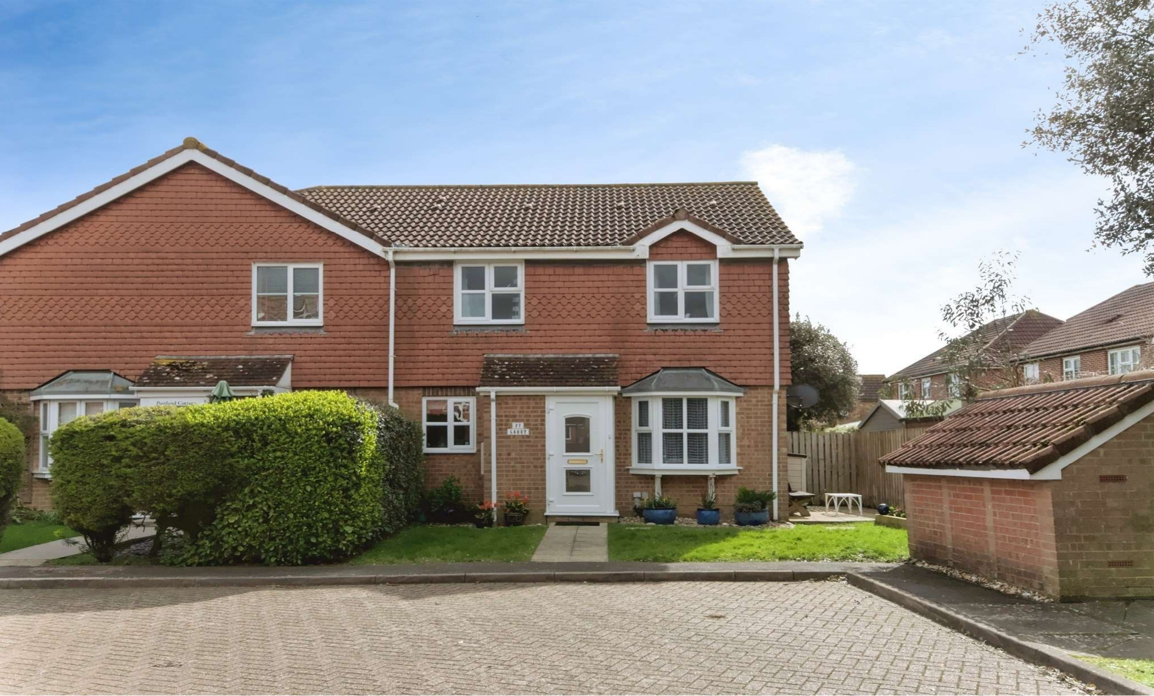
The Portlands, Eastbourne BN23 5RD