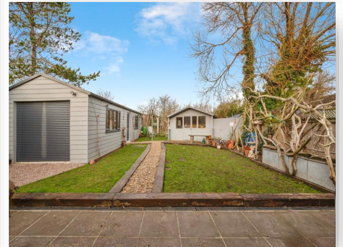
Meadow Lodge, Walcott Road, Bacton NR12 0EY