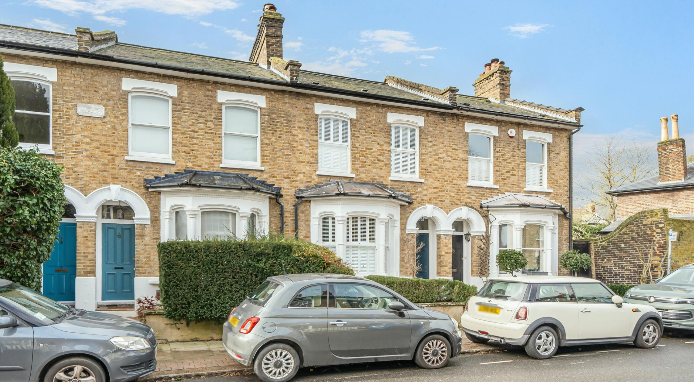
Gentlemen's Row, Enfield, EN2 6PU