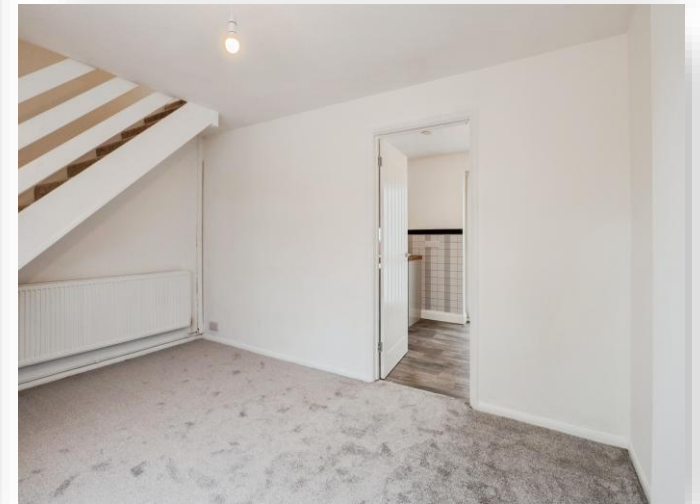
Deanside Drive, LOUGHBOROUGH