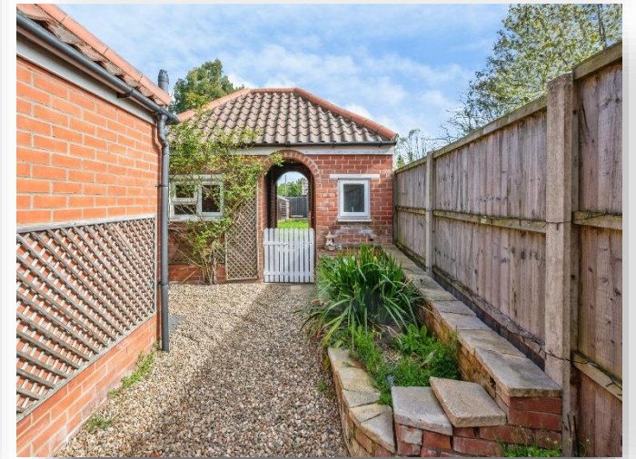
Station Road, North Walsham NR28 0EA