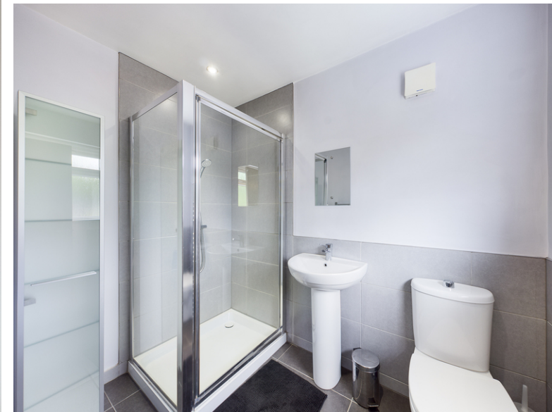
Room 4 37 Guinions Road, High Wycombe, HP13 7NT