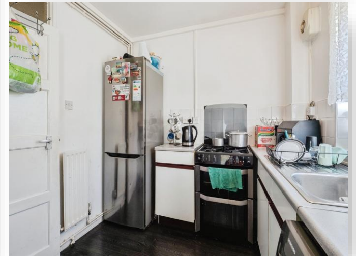
Thurcaston Road, Leicester LE4 2QE