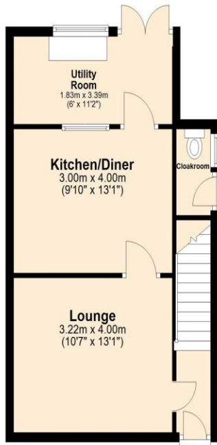
Ground Floor Approx. 38.0 sq. metres (409.0 sq. feet)