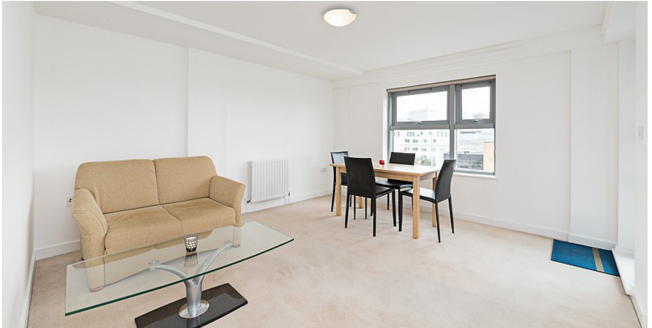
WILTON ROAD, Pimlico SW1V